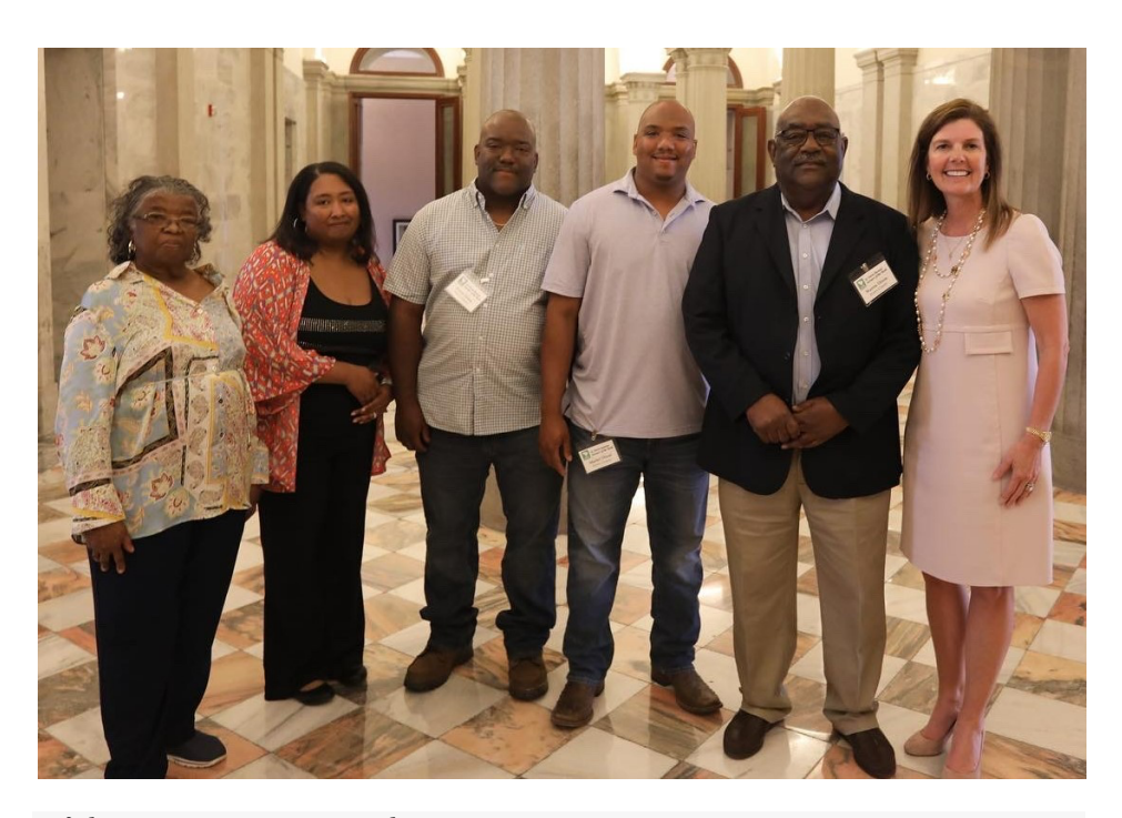
With Lt. Governor Pamela Evette.