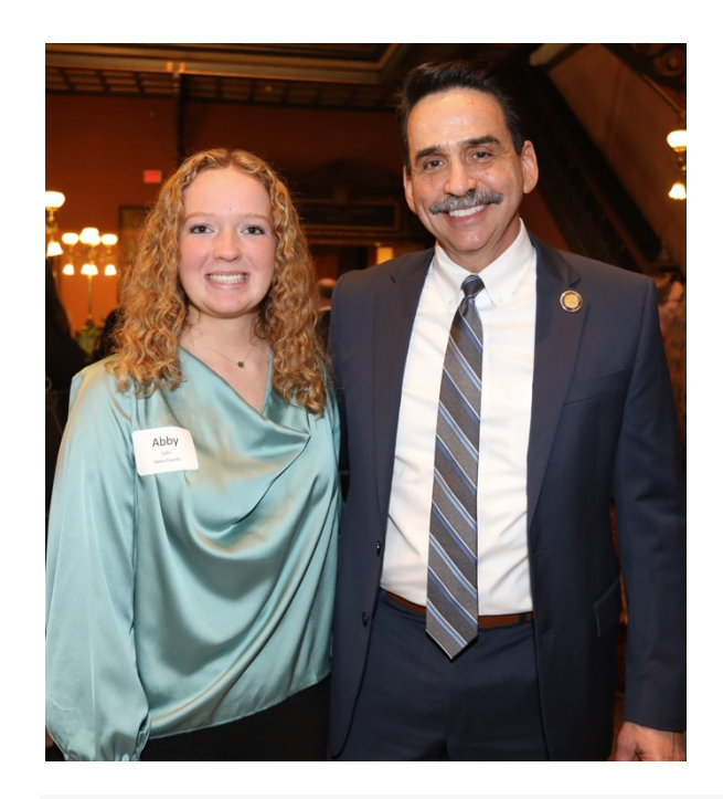
Abby Callis with Rep. Bart Blackwell (Aiken)