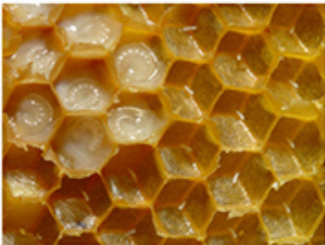
Honey bee eggs and larvae