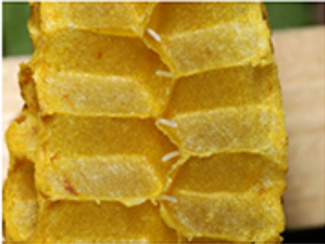
Honey bee eggs shown in opened cells